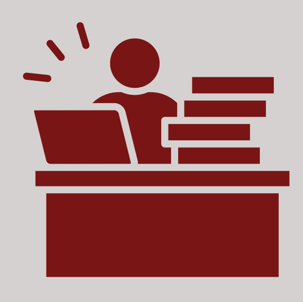
A massive workload for your team