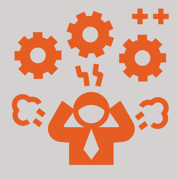
Frustration for endusers, including customers and suppliers