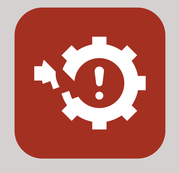
Process interruptions and non-compliance